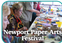
Newport Paper Arts Festival

Arts in Health Care Fiscal Sponsorships - Lincoln County Cultural Coalition & Oregon Coast Chamber Music Society Jazz at Newport Clinics & Jazz Panel Learn By Doing Grantwriting Workshops in Coos & Douglas counties Nestucca Valley Artisans Newport Paper Arts Festival Non-Profit Board Training in Tillamook OCCA Theatre Camps & Shakespeare Camp Tillamook County Arts Network Washed Ashore School Residency