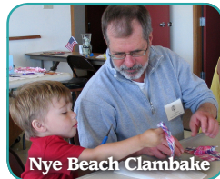
Nye Beach Clambake

Community Legends Culture Shock – Africa Day Dinner with Will Met Opera Live in HD National Theatre London Live HD Nye Beach Clambake Performing Arts Center Events Jazz at Newport Visual Arts Center Exhibits & Receptions