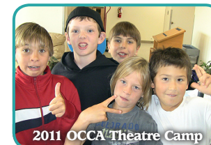
2011 OCCA Theatre Camp