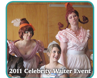
2011 Celebrity Waiter Event