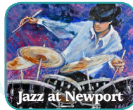
Jazz at Newport