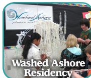
Washed Ashore Residency