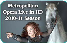
Metropolitan Opera Live in HD 2010-11 Season