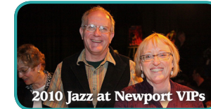
2010 Jazz at Newport VIPs